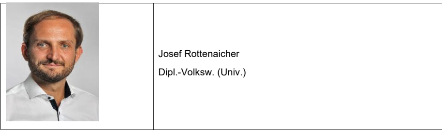
Image material: (free to use with source attribution " ")