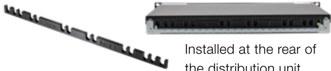
Installed at the rear of the distribution unit